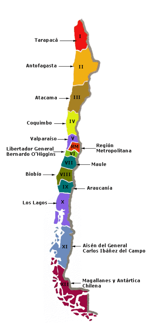
Figure 1: Chile's Thirteen Regions